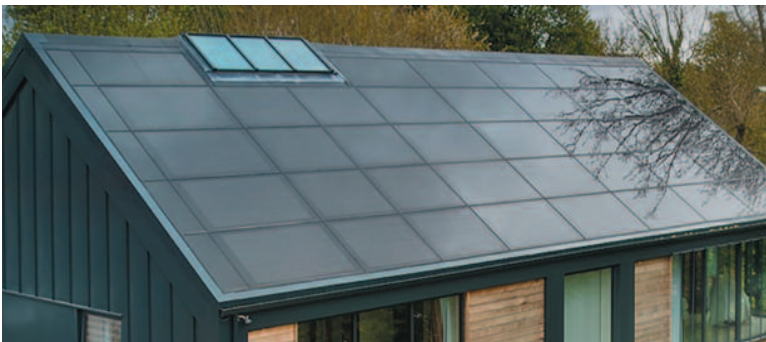
A lantern in the apex of the roof.

Please contact us in advance to discuss the possibilities for your project and to ensure that windows and spacings are suitably sized.