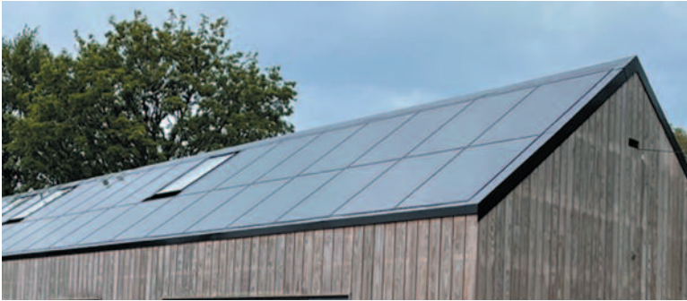
Infinity roof incorporating outward opening rooflight

Infinity solar roofs can incorporate roof windows and roof lights from most mainstream manufacturers. Our powder coated aluminium flashings provide an attractive waterproof seal between the solar panels and the window unit.