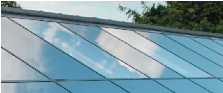
For passive houses, a popular option is to use inward-opening triple glazed roof windows, set under a clear glass unit instead of a solar panel.